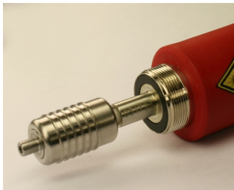
FIBERPOINT® 250 with Adapter