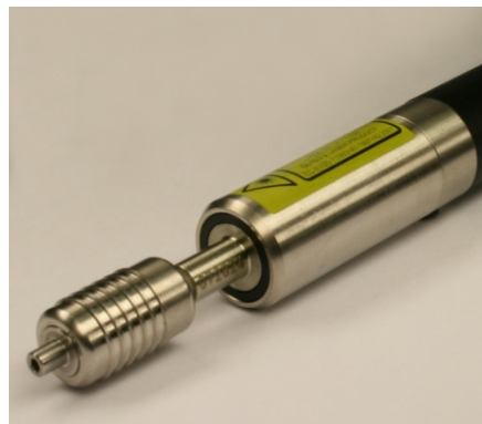
FIBERPOINT® 250MD with Adapter