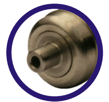
Ferrule 1.25 mm