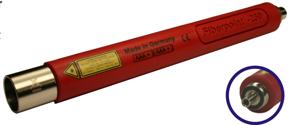
Ferrule 2.5 mm