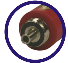
Ferrule 2.5 mm