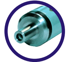
Ferrule 2.5 mm